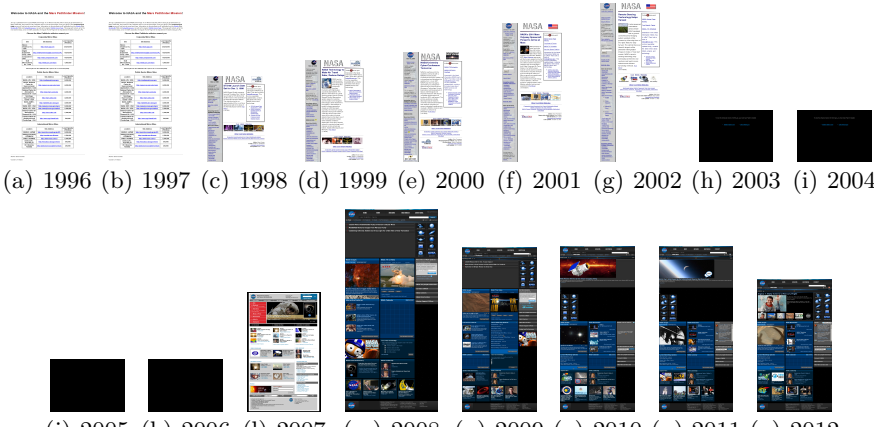
(j) 2005 (k) 2006 (l) 2007 (m) 2008 (n) 2009 (o) 2010 (p) 2011 (q) 2012

Fig. 8. NASA over time. Changes in design and thus the technologies used is easily observable between Figures 8(b) and 8(c), 8(g) and 8(h), 8(k) and 8(k), and 8(l) and 8(m)