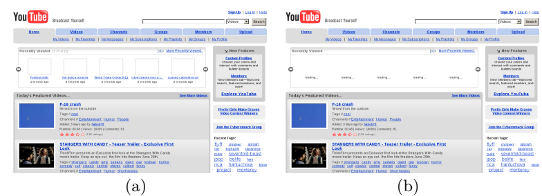
Fig. 4. A YouTube memento from 2006 shows a subtle distinction in display when JavaScript is enabled (Figure 4(a)) and disabled (Figure 4(b)) at the time of capture. The Ajax spinner (above each "loading" message in Figure 4(b)) is never replaced with content, which would be done were JavaScript enabled on capture. When it was enabled, the script that gathers the resources to display (blank squares in the same section of the site in Figure 4(a)) is unable to fetch the resources it needs in the context of the archive. The URIs of each of these resources (the image source) is present as an attribute of the DOM element but because it is generated post load, the crawler never fetches the resource for preservation.

Figure 4(b) shows the same memento fetched with JavaScript off. The placeholder Ajax "spinner" demonstrates that the JavaScript to overwrite the DOM elements is present in the archive and executable but the resources needed to fully build this web page do not exist in the archive.