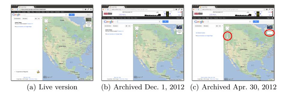
Fig. 1. Google Maps is a typical example where the lack of completeness of the archive is easy to observe. Figure 1(a) shows how the web page should look. The map in the middle has interactive UI elements. An archived version of this page (Figure 1(c)) is missing UI elements (circled), and the interaction does not function. Figure 1(b) shows a recently archived (December 1, 2012) version that gives the façade of functionality when, in fact, resources on the live web are being loaded.

The success of preservation of a web page is defined by how much of the originally displayed content is displayed on replay. The success of a consistent replay experience when the original experience contained a large amount of potential user interactivity (and more importantly, the loading of external resources not initially loaded) might not rely on the level of interactivity able to be re-experienced at replay. The success of this experience is dependent on whether all of the resources needed to properly display the web page on replay were captured at the time of archiving and are loaded when the archive is replayed.